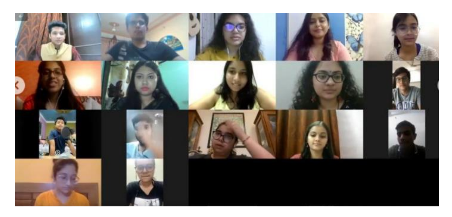
Our volunteers on cultural night