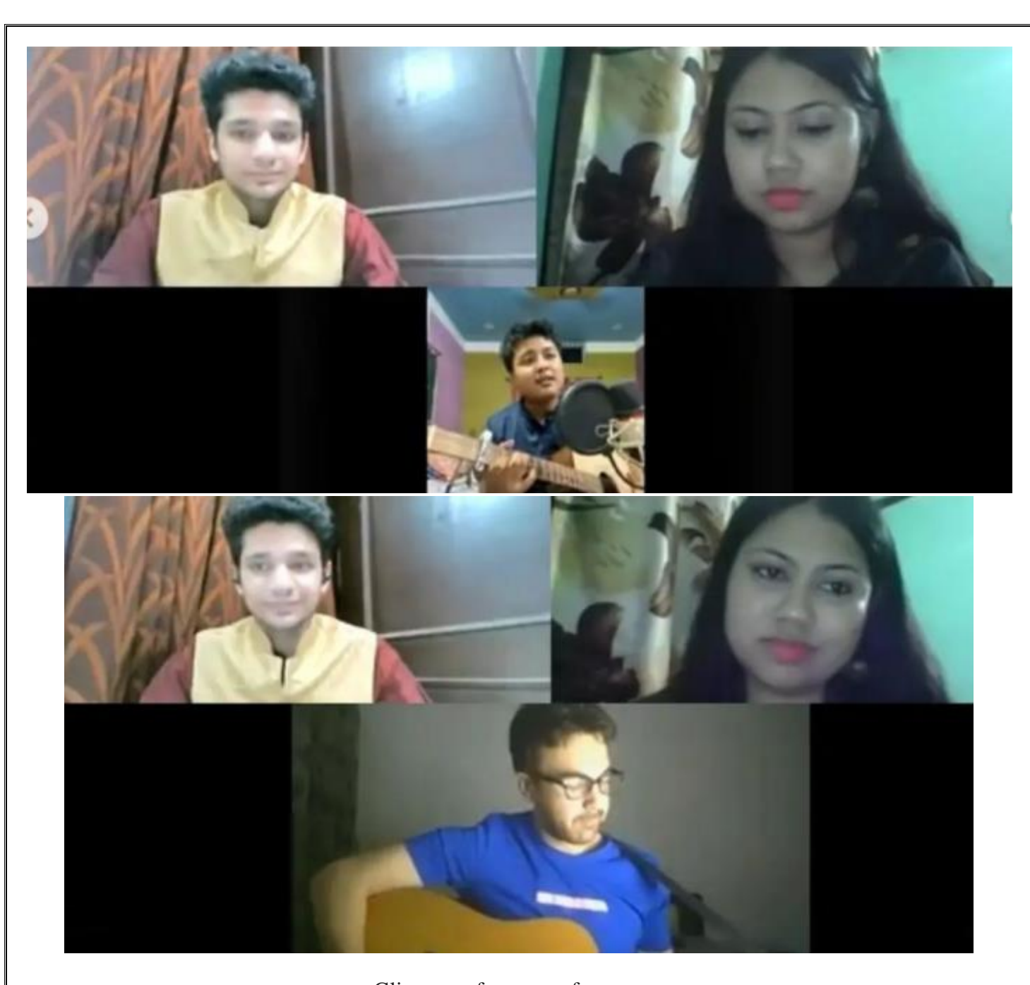
Glimpses of some performances